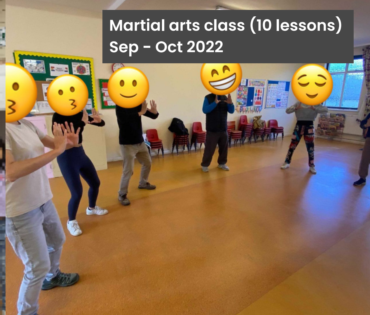
Martial arts class (10 lessons) Sep - Oct 2022