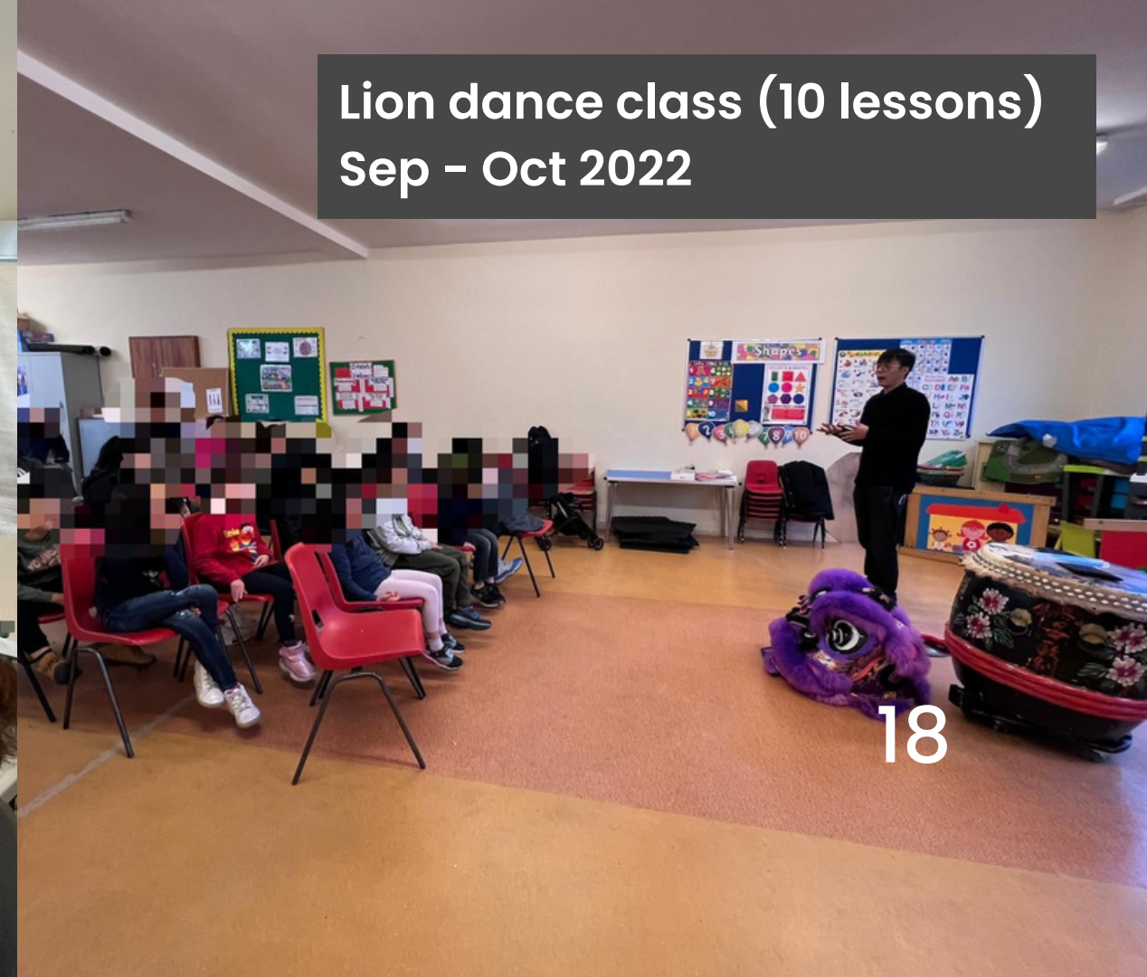
Lion dance class (10 lessons) Sep - Oct 2022