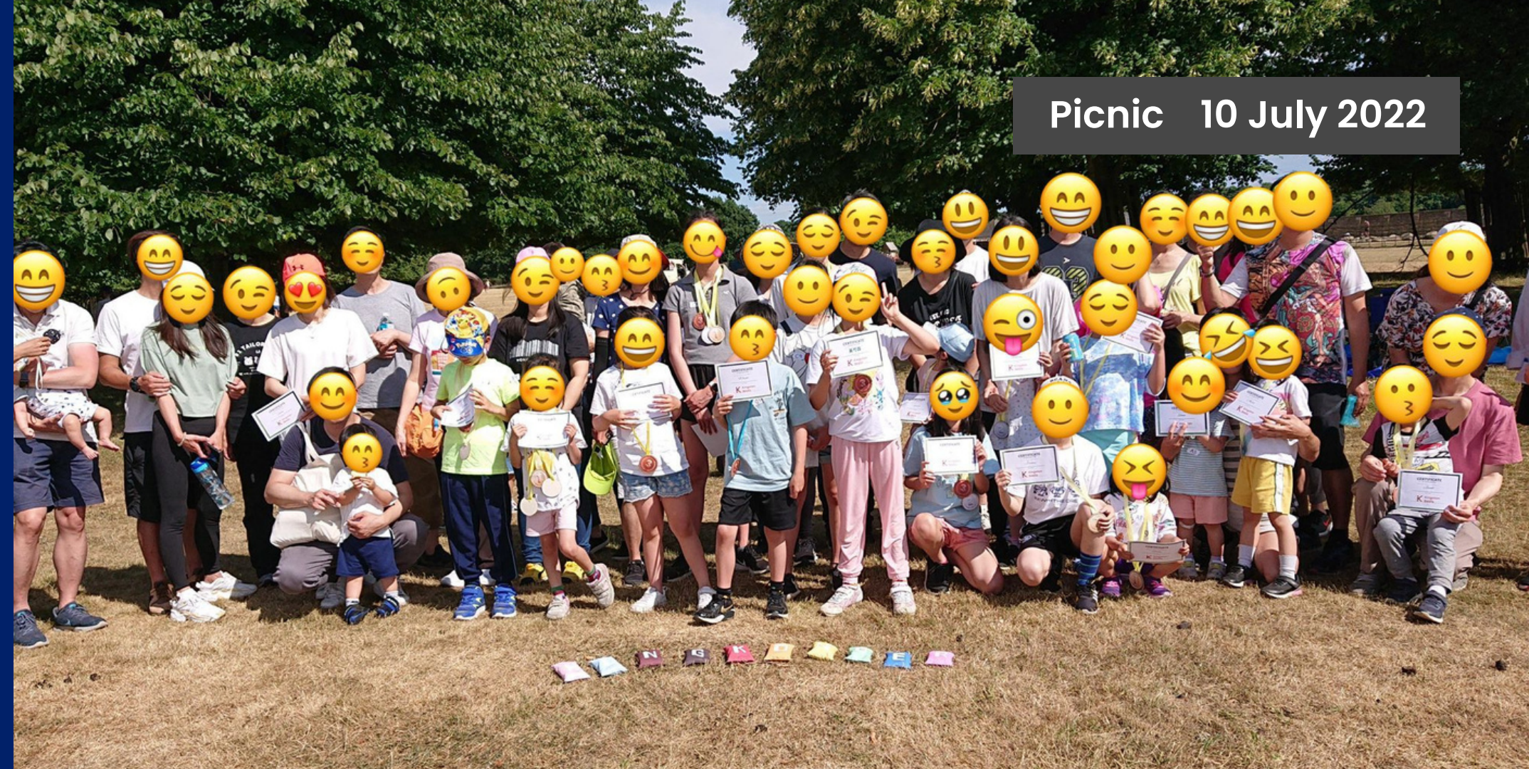
Picnic 10 July 2022