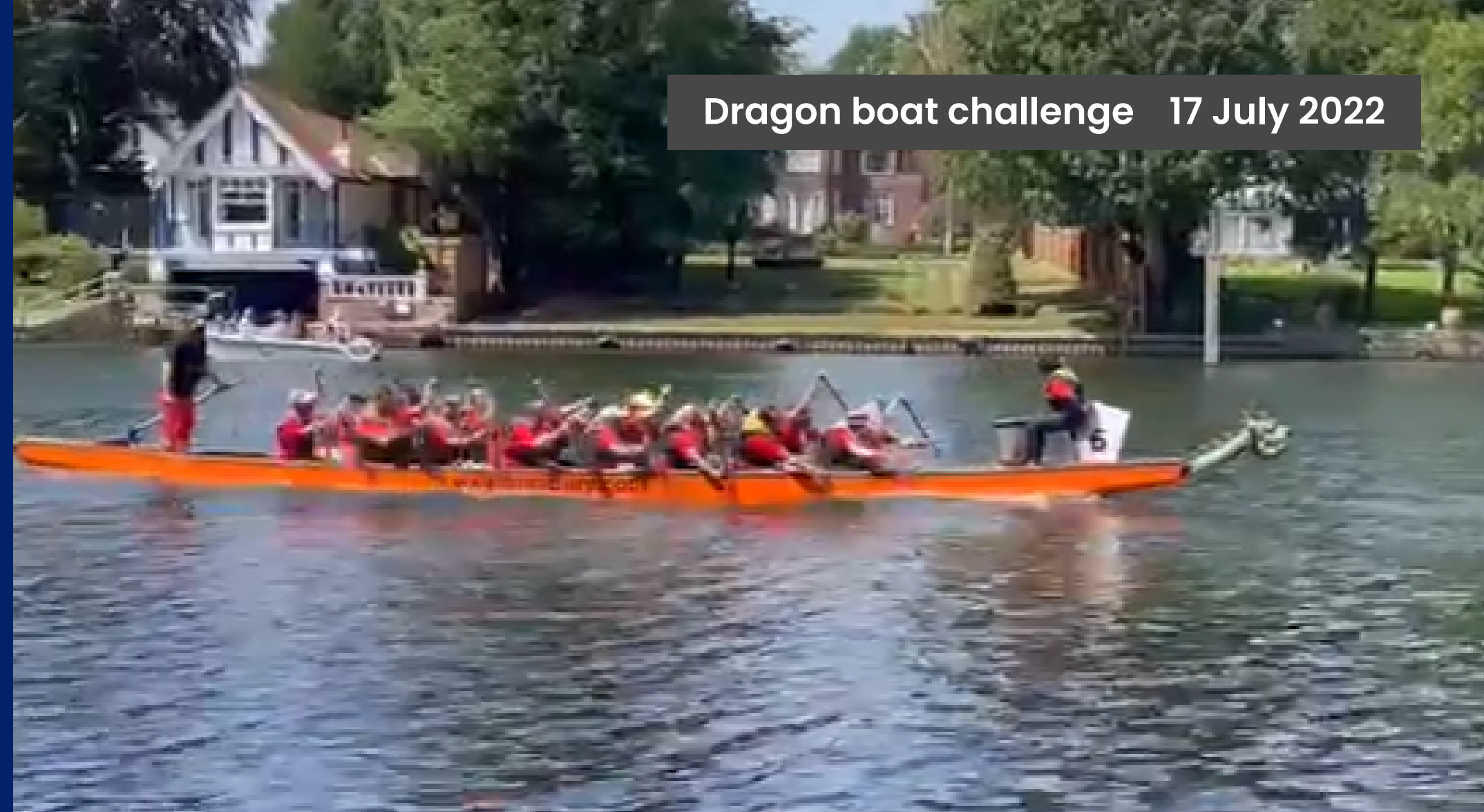
Dragon boat challenge 17 July 2022