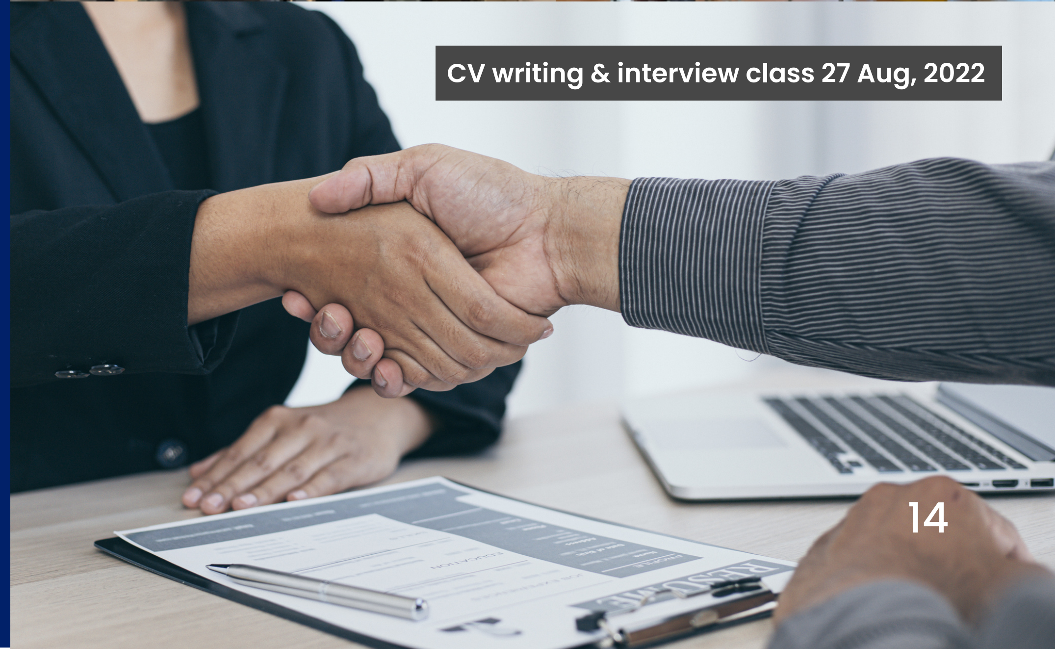
CV writing & interview class 27 Aug, 2022