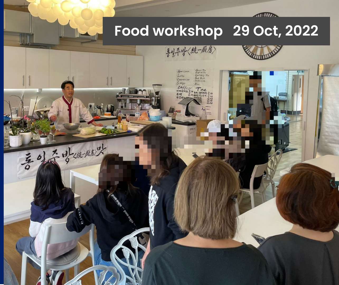
Food workshop 29 Oct, 2022