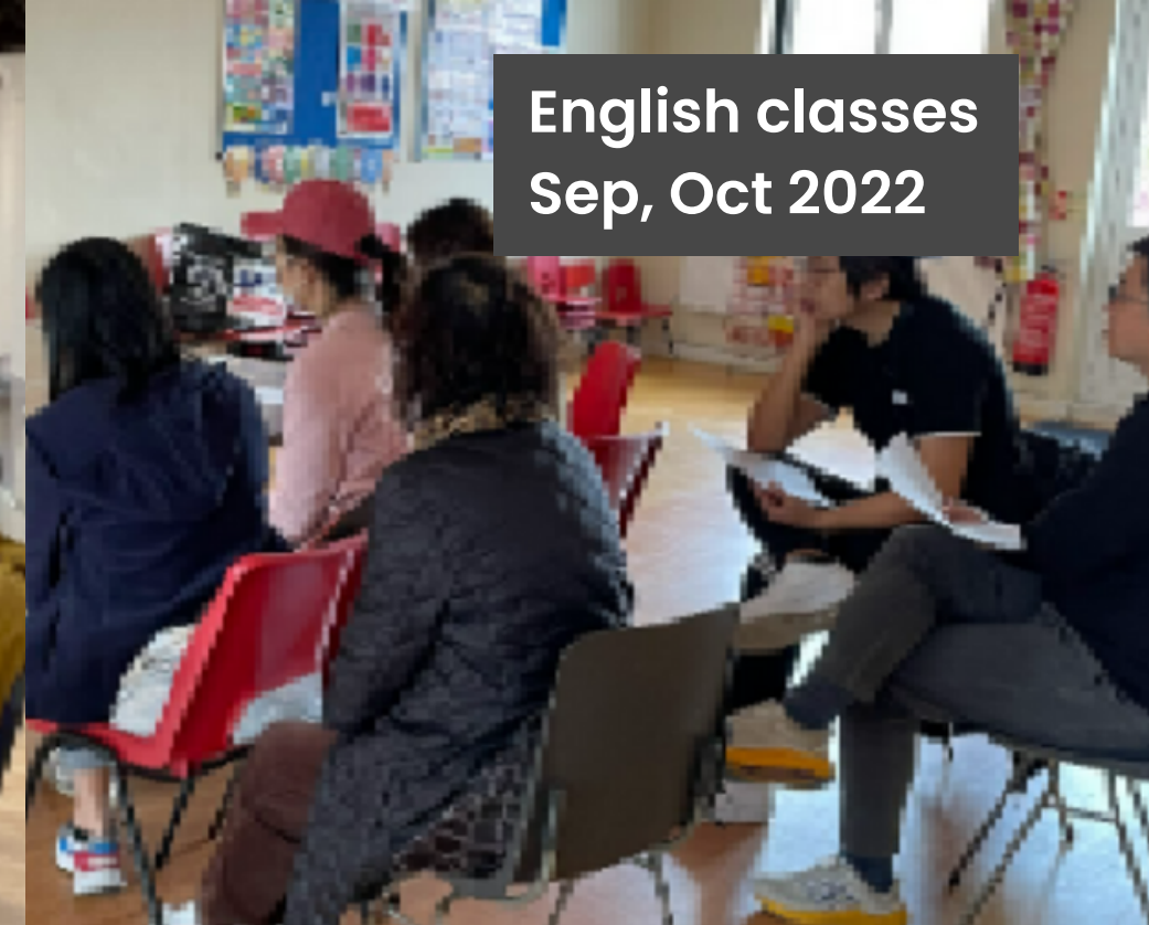
English classes Sep, Oct 2022