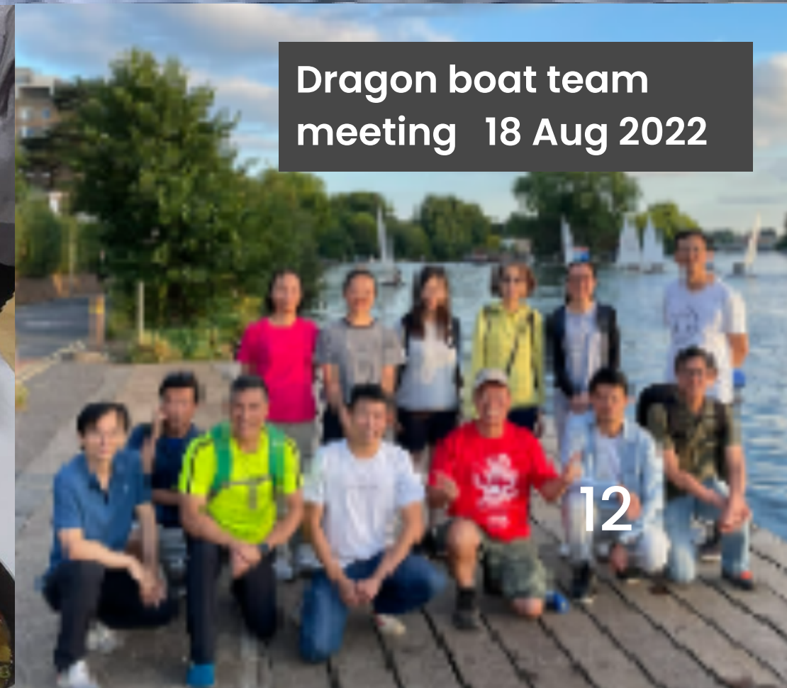
Dragon boat team meeting 18 Aug 2022