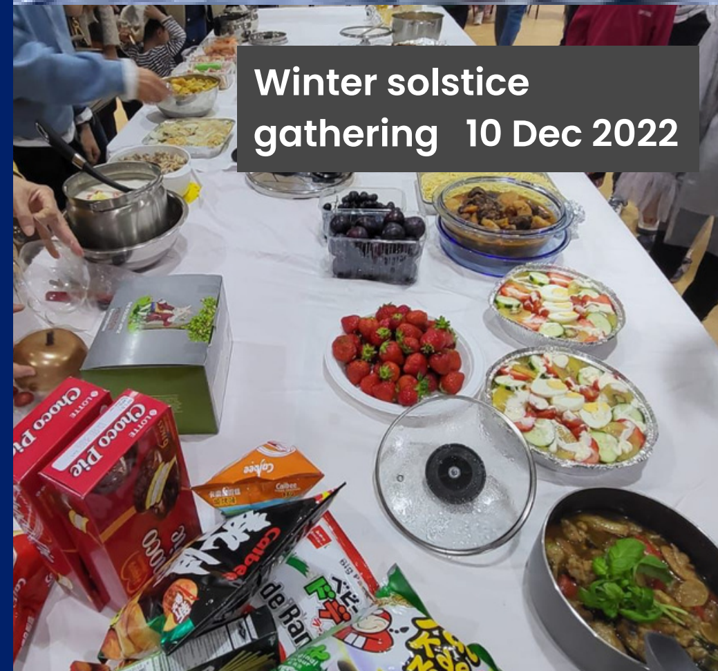
Winter solstice gathering 10 Dec 2022