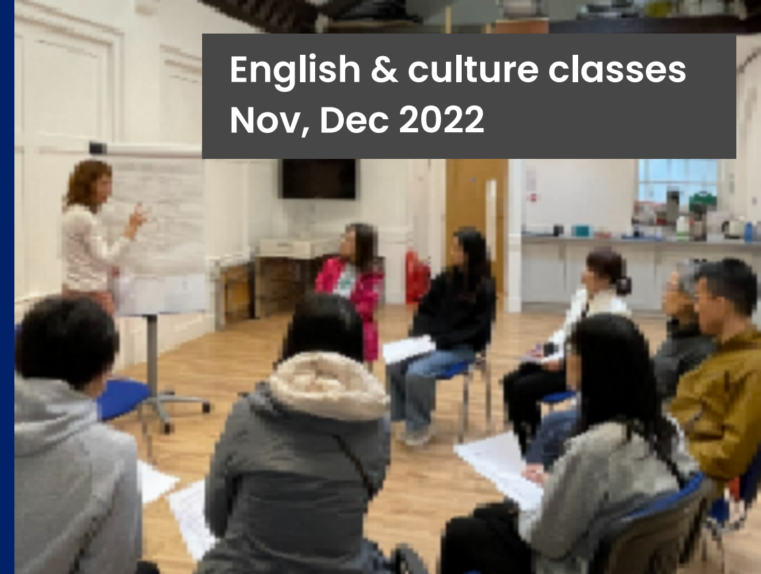
English & culture classes Nov, Dec 2022