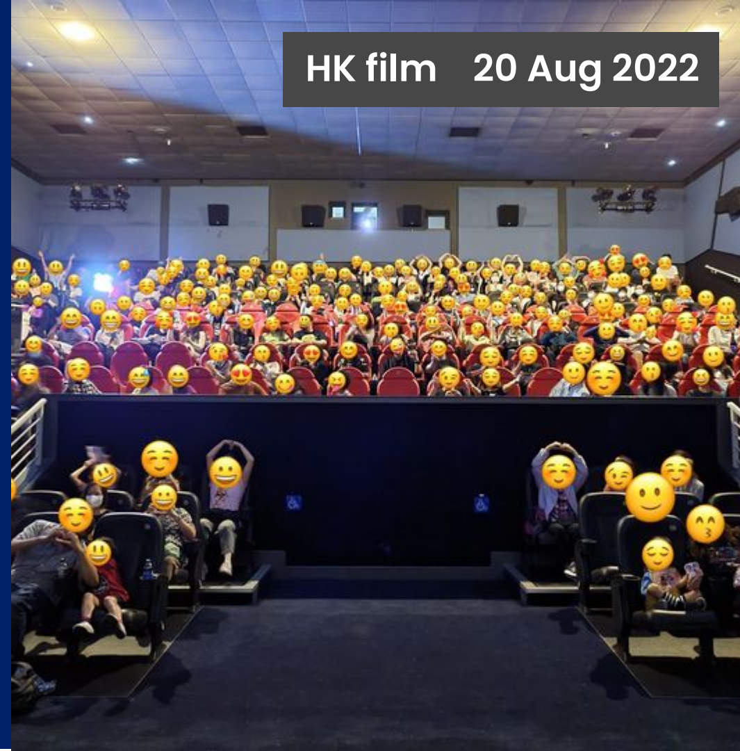
HK film 20 Aug 2022