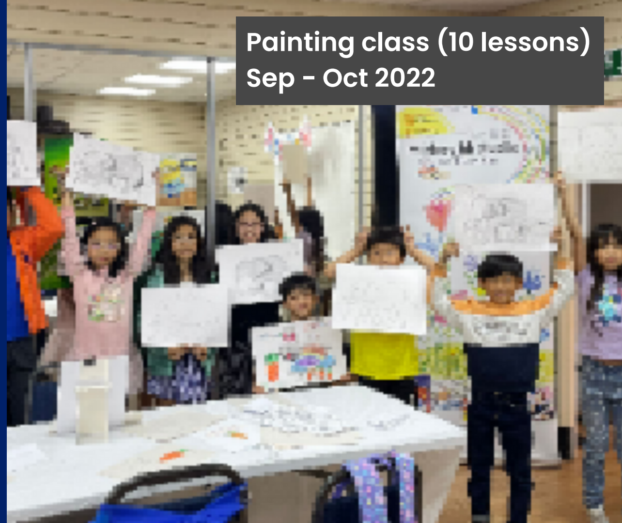
Painting class (10 lessons) Sep - Oct 2022