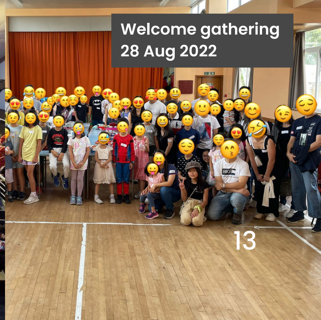
Welcome gathering 28 Aug 2022